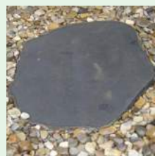
Steppers in gravel