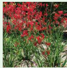
Kangaroo Paw Anigozanthos flavidus