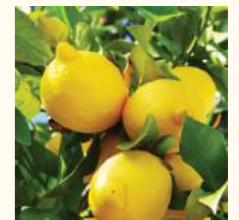
Lemon Tree Citrus limon