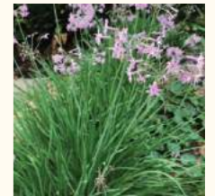
Society Garlic Tulbaghia violacea