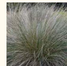
Coastal Tussock Grass Poa poiformis