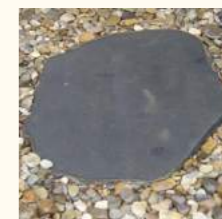
Steppers in gravel

Disclaimer: Front landscape package excludes driveways, letterboxes and fencing