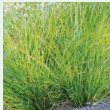
Mat Rush Lomandra longifolia 'Tanika'