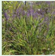
Tasman Flax-lily Dianella tasmanica