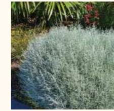
Cushion Bush Leucophyta brownii