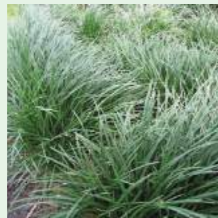
Mondo Grass Ophiopogon japonicus