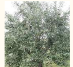
Olive Tree Olea europaea