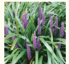
Lilyturf Liriope muscari