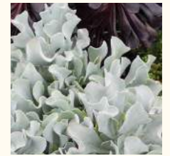
Pig's Ear Cotyledon orbiculata