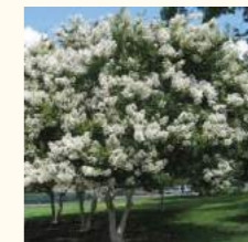
Crepe Myrtle Lagerstroemia indica 'Natchez'