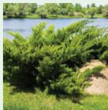
Juniper Juniperus sabin