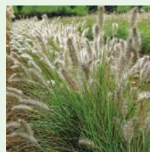
Foxtail Grass Pennisetum alopecuroides