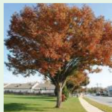
Japanese Elm Zelkova serrata 'Schmidtlow'