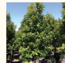
Water Gum Tristaniopsis laurina