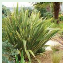
Flax Phormium tenax