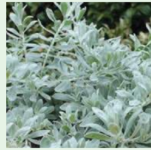
Emu Bush Eremophila 'Blue Horizon'