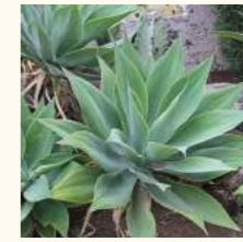
Agave Agave attenuata