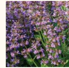
Garden Sage Salvia officinalis