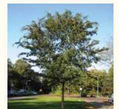
Chinese Elm Ulmus parvifolia