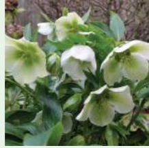
Hellebore Helleborus orientalis