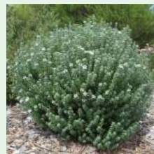
Native Rosemary Westringia fruticosa 'Grey Box'