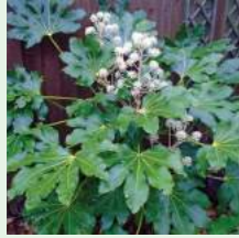
Japanese Aralia Fatsia japonica