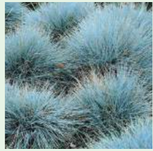
Blue Fescue Grass Festuca glauca