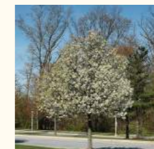
Ornamental Pear Pyrus calleryana 'Aristocrat'