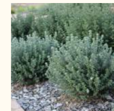
Native Rosemary Westringia fruticosa