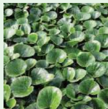
Tractor Seat Plant Ligularia reniformis