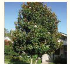
Magnolia Magnolia grandiflora 'Little Gem'