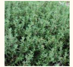
Thyme Thymus vulgaris