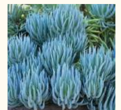
Blue Chalk Sticks Senecio mandraliscae