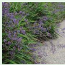
Blue Flax Lily Dianella caerulea 'Little Jess'