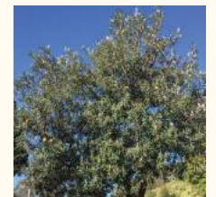
Coast Banksia Banksia integrifolia