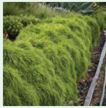
River Wattle Acacia cognata 'Limelight'