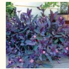
Purple Heart Tradescantia pallida