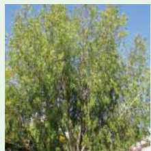
Wilga Geijera parviflora