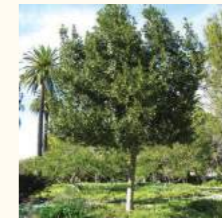
Bay Tree Laurus nobilis