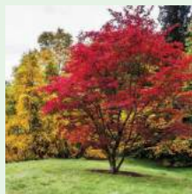
Japanese Maple Acer palmatum