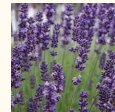
English Lavender Lavandula angustifolia