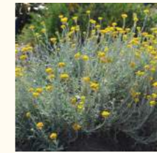
Yellow Buttons Chrysocephalum apiculatum