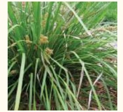
Basket Grass Lomandra longifolia