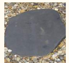
Steppers in gravel