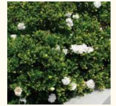
Gardenia Florida Gardenia augusta 'Florida'