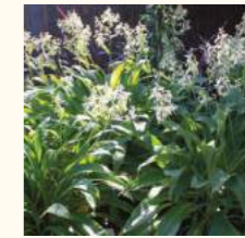
Renga Renga Lily Arthropodium cirratum