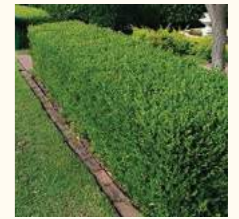
Boxwood Buxus sempervirens