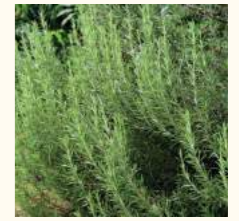
Rosemary Rosmarinus offi cinalis