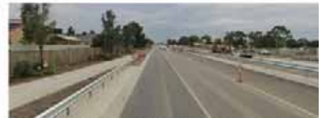
2 Hallam Road, looking north, near interface to existing slimes drying area at 290 Hallam Road