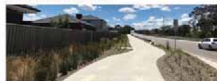
3 Hallam Road shared path (west side), looking north, near interface to lanette frontage at 310 Hallam Road (image source: Google)