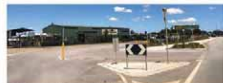
4 Existing Garden Nursery at 726 South Gippsland Highway (corner Hallam Road)