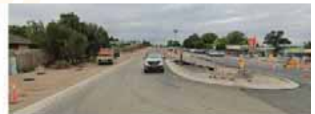
1 Hallam Road, looking north, at interface to Garden Nursery at 270 Hallam Road